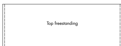
Top freestanding - cover end panels in both ends

London wood and London steel tops are available as freestanding, intermediate and outer tops. Freestanding top is always used for 1 bay and can be used up to 3 bays for London Wood and up to 2 bays for London steel. Intermediate and outer tops can be used for 2 or more bays.