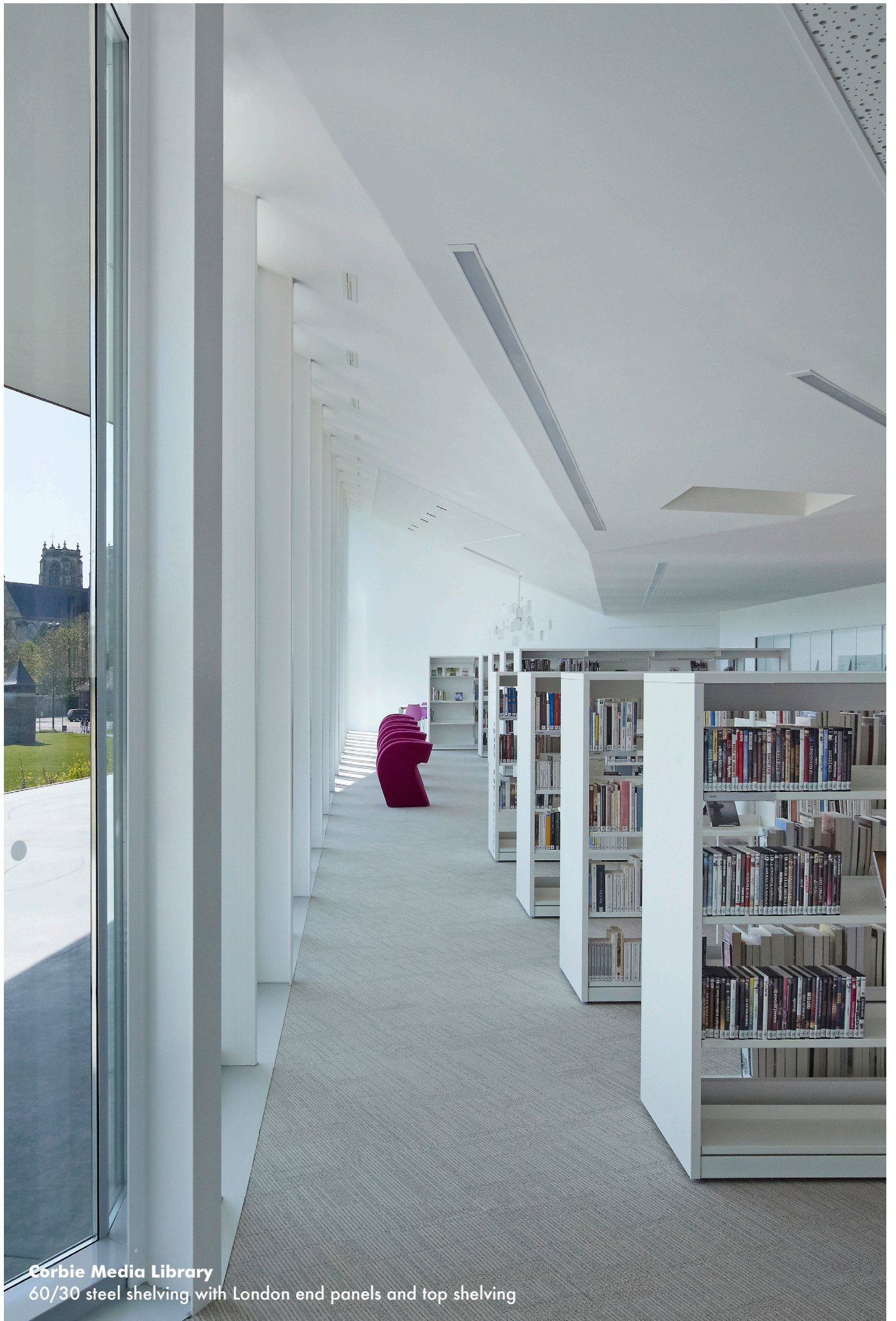
Corbie Media Library 60/30 steel shelving with London end panels and top shelving